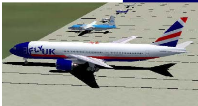
Left: Fly UK Virtual Airways first ever livery on a Boeing 777.