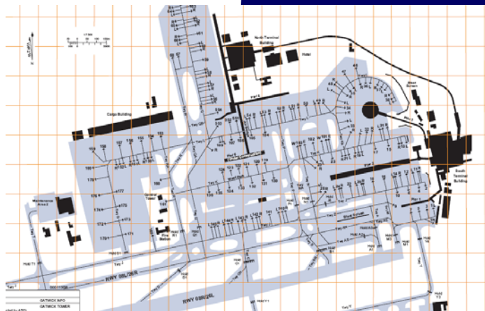
Above: EGKK Parking Chart

Total Flights: 68 Total European Flights: 24 Total International Flights: 34 Total UK Domestic Flights: 10