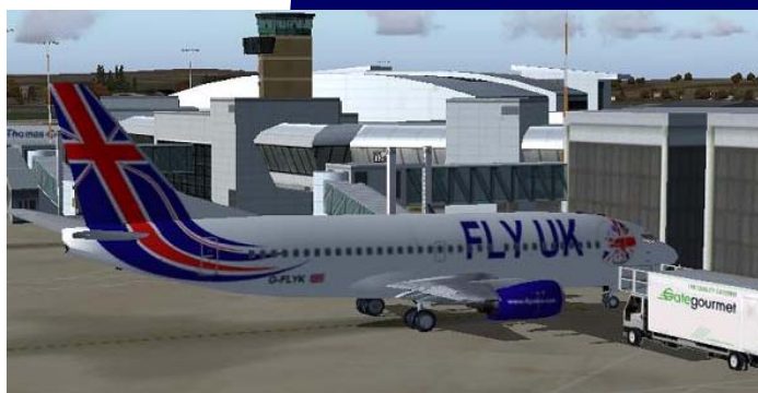
Left: Today's Fly UK Livery on our Boeing 737-300 (G-FLYK)