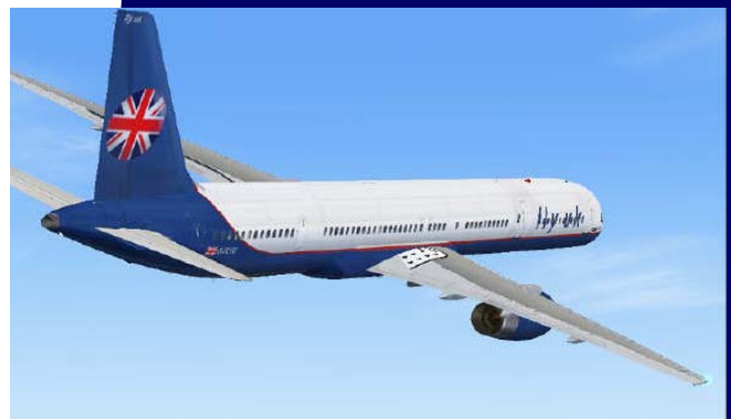
Above: G-FLYU B757-300 in second Fly UK livery!