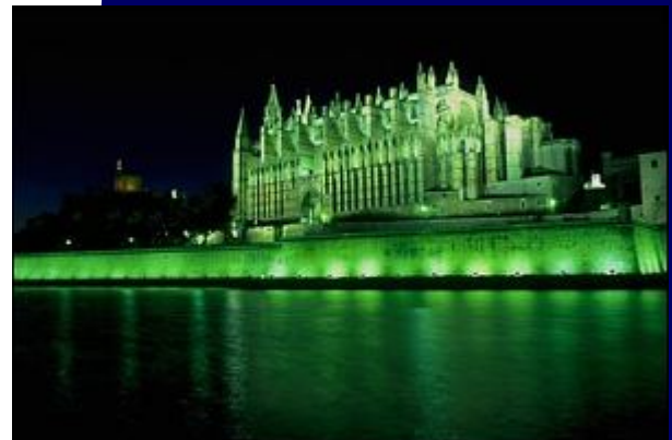
Above: Cathedral at night.

Thanks to Jet2.com for their permission to include this article from their Jet Away In Flight Magazine.