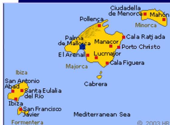
Above: Balearic Islands