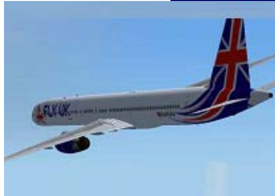
Left: Fly UK Virtual Airways Boeing 757-300 Aircraft

The -300's 27 month development program from final configuration to planned first delivery is the fastest for any Boeing airliner (the 777-300 took 31 months for example). Other early customers were Icelandair, Northwest, American Trans Air, Continental, and JMC Air.