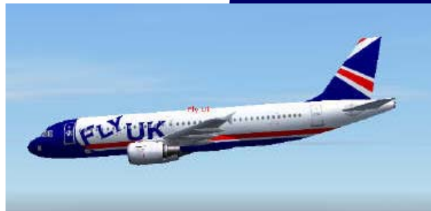
Left: Fly UK Virtual Airways first ever livery on our Airbus A320