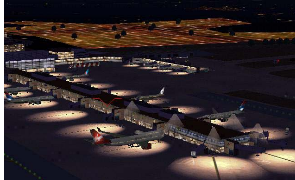
Left: UK2000 EGKK Scenery (Payware)